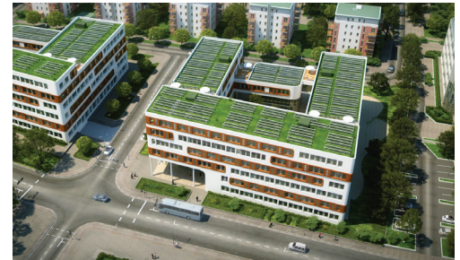
Design by Falk Von Tettenborn Architects.

Quickly and easily transform your AutoCAD designs into compelling imagery, movies, and interactive presentations for design reviews and sales pitches. Evaluate design variations and accelerate feedback by reducing the need for physical prototypes and long rendering times.