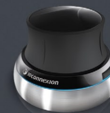
SpaceNavigator™ for Notebooks Portable 3D Mouse