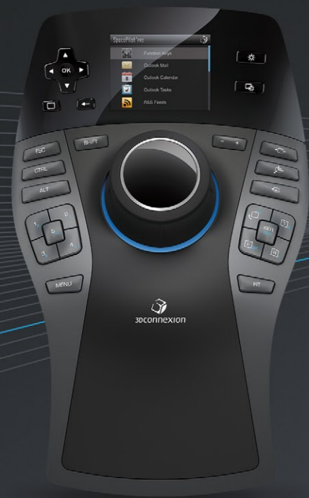
SpacePilot™ PRO The Ultimate Professional 3D Mouse