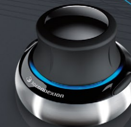
SpaceNavigator™ 3D Mouse

SpacePilot PRO is the ultimate professional 3D mouse, engineered to excel in today's most demanding 3D software environments.